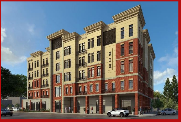
19 W. Canal Street