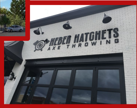
112 W. Kennewick Ave