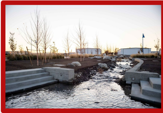
Vista Filed Waterway